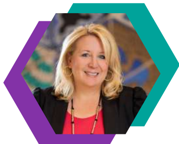
Dean of Pre-College & Summer Programming Albright College

The ATHENA® Leadership Award is presented to a woman/man who is honored for professional excellence, community service, and for actively assisting women in their attainment of professional excellence and leadership skills.